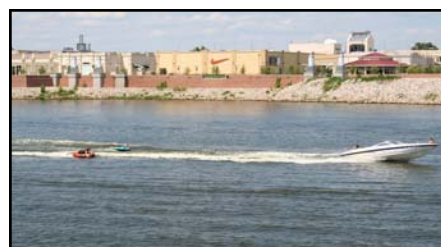
BOATING ON THE RED RIVER